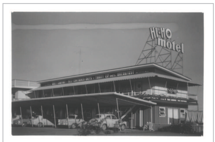
Hi Ho Motel, Queensland Avenue, Broadbeach (1958)