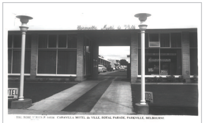
Caravilla Motel de Ville, 461 Royal Parade, Parkville (1958)