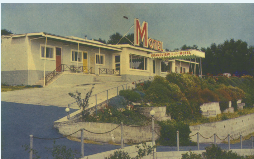
From top: Kirriwina Motel, Gympie Terrace, Noosaville (c.1960) Skyrider Motel, Western Highway, Katoomba (c.1960) Grandville "The Lakes" Motel, Lake Terrace, Mount Gambier, SA